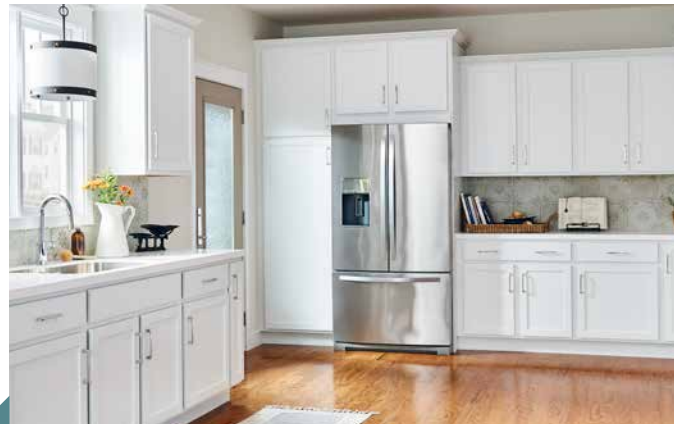
SHEA DOOR STYLE

True to its name, Builders Mark™ cabinets offer designers, contractors, and builders ample design opportunities at an extremely affordable price point. The Vero series — a collection of two door styles with three popular finishes — offers you more options to give any size project some added style and increased durability.