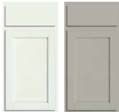
Pearl SmartShield™ Cinder SmartShield™