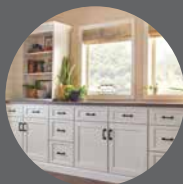
Kitchen & Bath

Find us on Instagram @ wolfhomeproducts for inspiration on your next project!