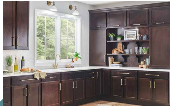
SLOANE DOOR STYLE